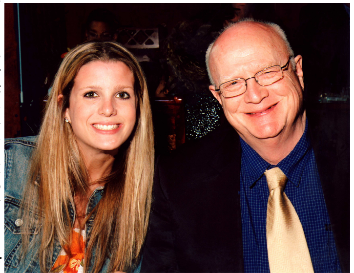
Beauty & the Beast

Finally my parents got back from their two-month long vacation and I am excited to spend some time with them over break. I hope next year I will have more to say and hopefully have a job.