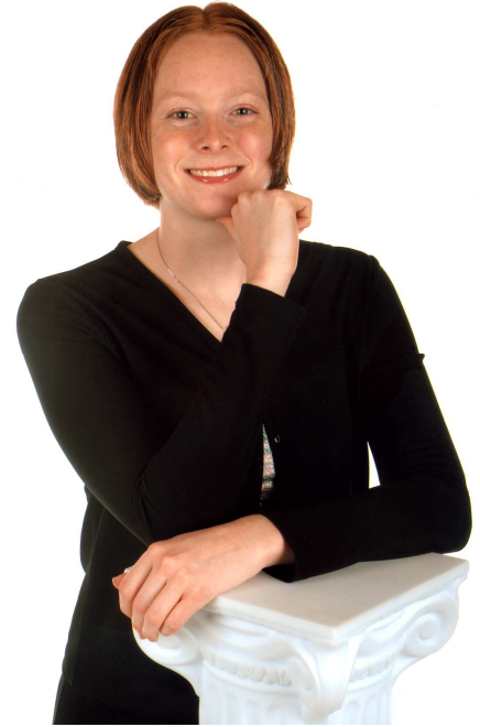
Classy Business Lady

It is hard to get in the holiday spirit when it is sunny with a high of 75 everyday, though I did purchase my first Christmas tree. A sturdy 6'5", with the lights pre-strung. Arizona has gorgeous weather everyday; I can swim, hike, and tan (?). So, here I am, learning about job analysis, recruitment, union negotiation, etc. I do miss the Pacific Northwest though. We have already had one snowstorm and hurricane force winds. There might have been one cloud in the sky here the other day, but no precipitation made it to us.