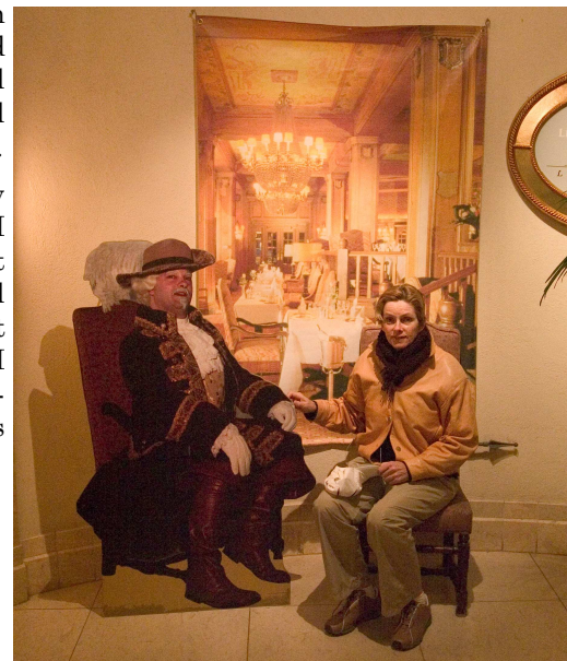
Adele has always liked older men!

To top it all off, we recently finished our cruise to Africa and South America. The best parts of that cruise were breakfasts in the room and unlimited laundry and ironing service. Concerning my watercolors, I try to paint every day and on the last cruise I painted fourteen paintings – a new record.